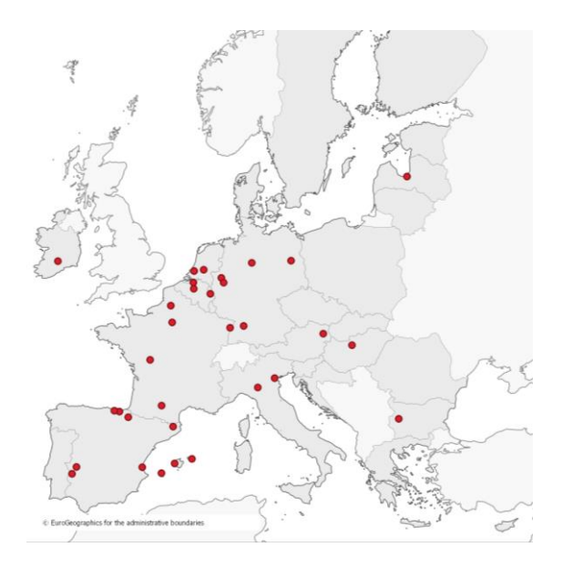
Figure 2: Current market offer along the customer journey for home energy renovation

for the different steps of the customer journey identified in Figure 1. This does not exclude that other initiatives may be as relevant.