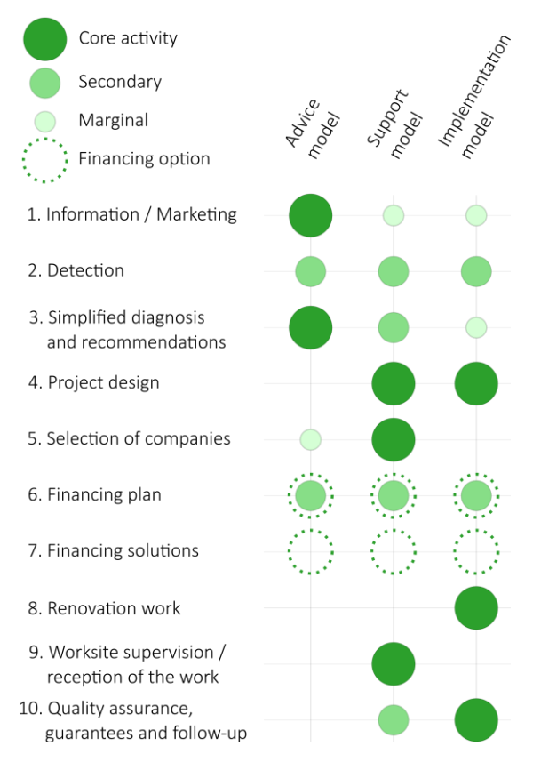
Figure 3: Main models of integrated home renovation services

even in the absence of a contract or even though the contract does not mention any liability.